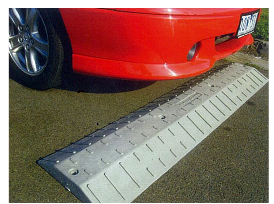
Speed Hump — made using the plastic from 400 two litre milk bottles